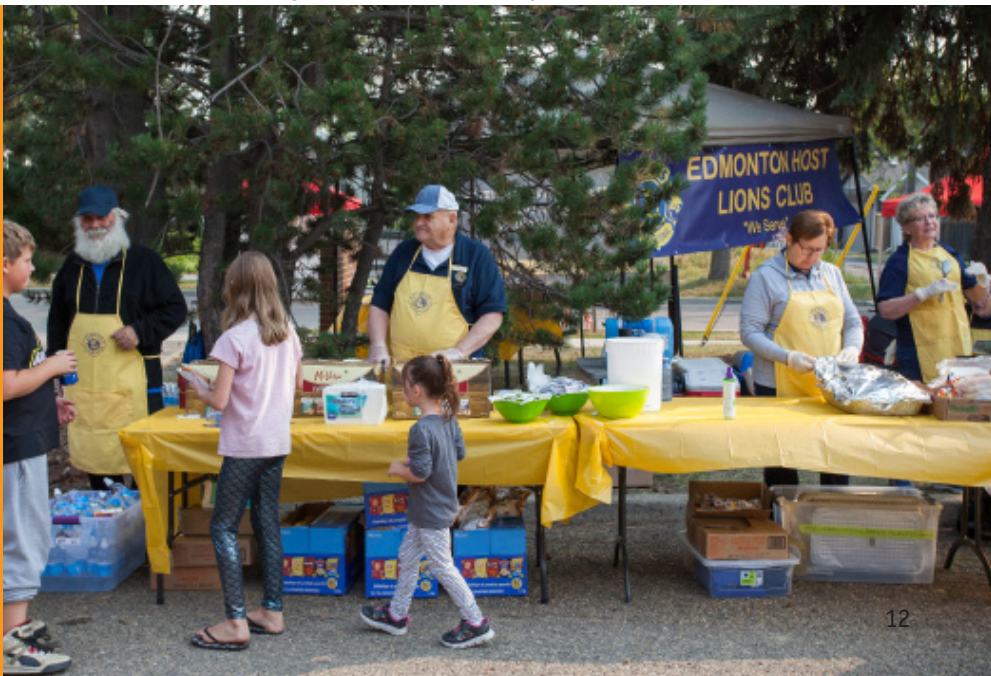
Edmonton Host Lions Club serving lunch at Terra’s Block Party

Time is one of our most precious resources and to all those who make time for us as we work with our participants - thank you.