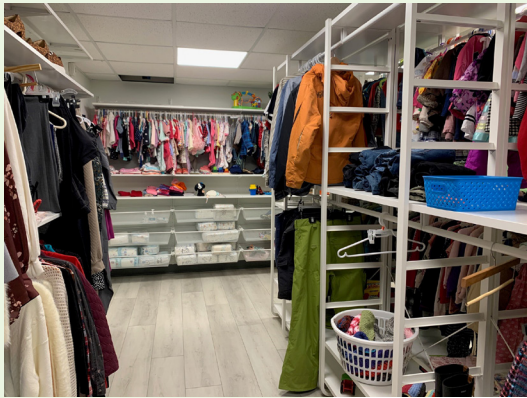
Newly renovated Clothes Closet

Thanks to an outpouring of early donor support, we are so much closer to realizing our vision of creating an inclusive hub for teen parents and the community. To date, we have raised more than $2.8M, approximately 70% of our $4,000,000 campaign goal.