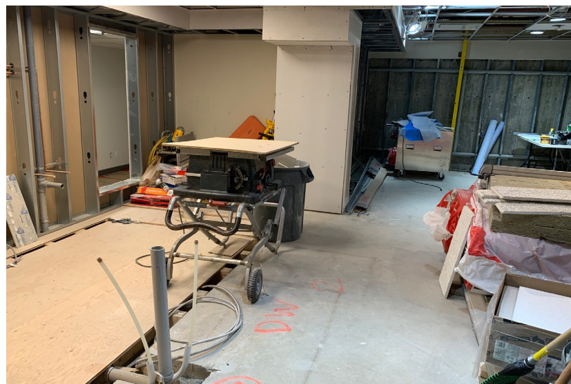
Collective Kitchen renovations in progress

We plan to begin the final phase of renovations in 2023 and complete this project by year-end, including the much-anticipated Parent and Child Engagement space. As with everything at Terra, the community is a part of our plan and progress, and we invite you to get involved. To learn more about our building project and vision, please contact Kejina Robinson krobinson@terracecentre.ca