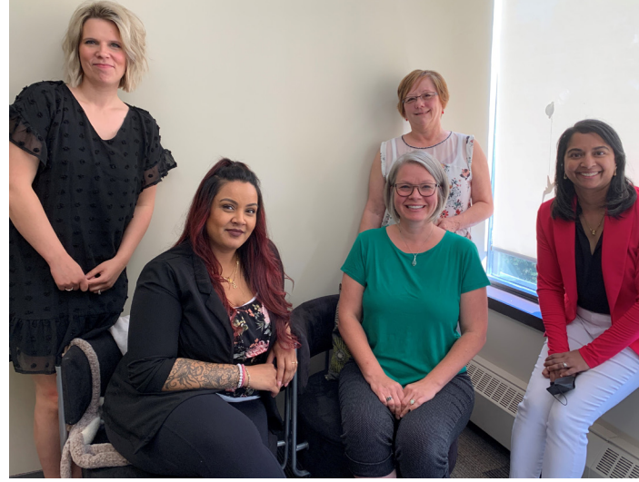
Terra's 2022 Mental Health team

By building-in appropriate relationship-based mental health supports, focused on solutions and concrete tools, students are in a stronger position to move forward toward healthier relationships, school completion, and the pursuit of stable living conditions.