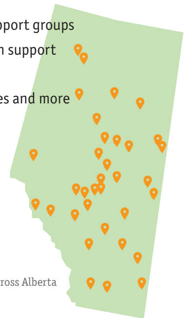
There are 70 FRNs across Alberta