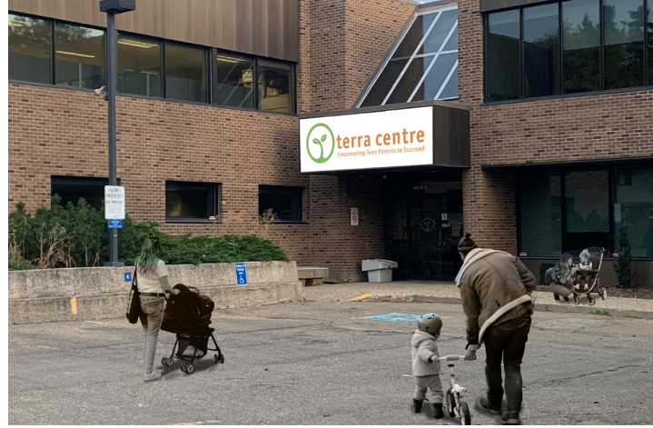
Terra's new west-central location | 10320 - 146 Street