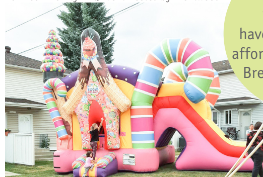
2021 Community BBQ Event Hosted by Brentwood

since 2014, 117 families have accessed safe, affordable housing at Brentwood Homes