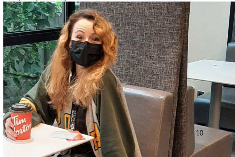
Terra participant taking in student life at the U of A