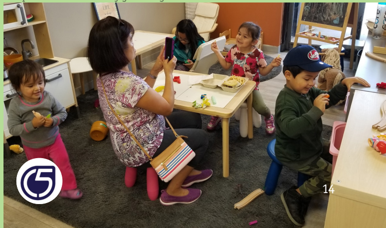
C5 Spirit of the Community gathering

As a collaborative of five agencies, together with community partners, we developed the NE Community Hub based on integrated service delivery. This means one door in for people to access the services they need - either right in the community, or with help to get to where they need to go. Families rarely present with a single need; they are usually dealing with multiple challenges and this model helps to address complex needs with the ability to access as many supports as possible in one place.