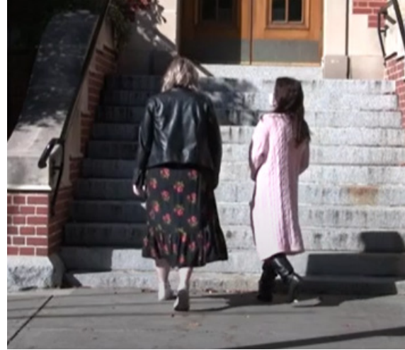
PHSTP Facilitator providing on-campus support.

When Terra first started, our work with teen parents included providing supports to help them complete their high school education. Since 2016, Terra has also been providing unique supports that address specific barriers to moving onto and succeeding in post-secondary programs.