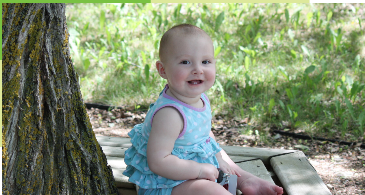
Celebrating graduation day with participants and their children