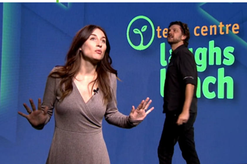
Rapid Fire Theatre Comedy Performers