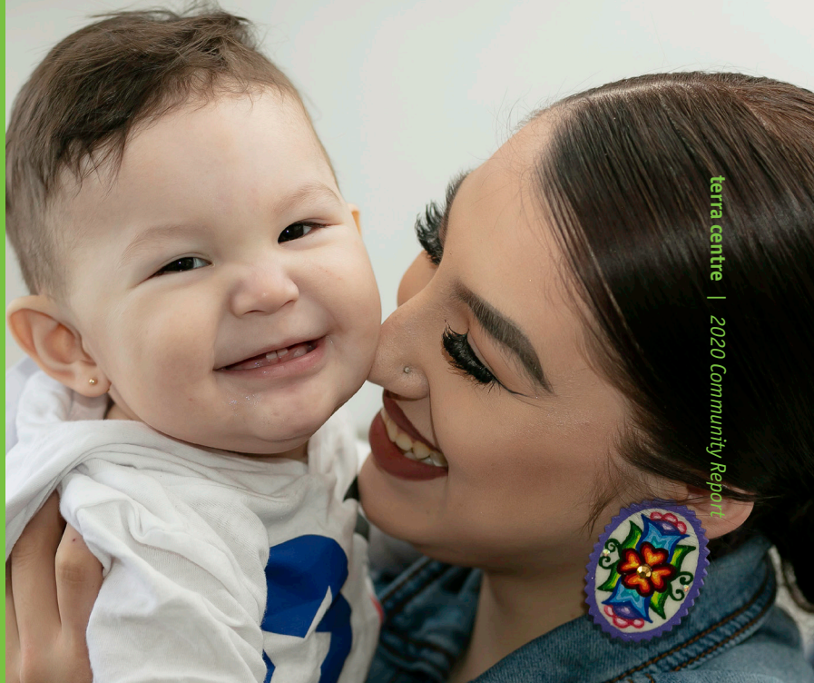
Terra Centre | 2020 Community Report