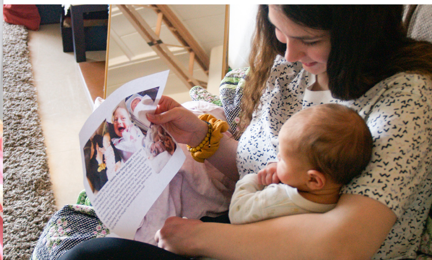
Sharing learning experiences together

Educators at the CFSC developed a number of creative ways to stay connected and engage parents in their child's learning. For example, educators have begun back-and-forth journaling with families. These journals proved to be successful in involving families in meaningful dialogue and bringing them into their child's learning experience. Our playground was a great space to invite moms to engage with their child through play while minding public health measures. CFSC is a community in itself and relationships are the foundation of our practice. Though the pandemic challenges our daily operations, our commitment to children and families remains strong.