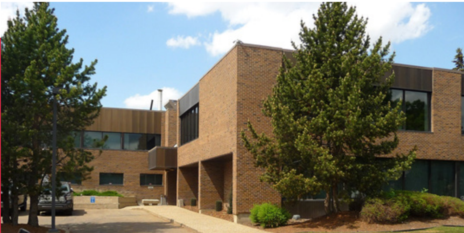
New building located at 10320 146 St NW

While our 50th anniversary is a time to reflect, we are excited to begin the next chapter of the Terra story in a new home.