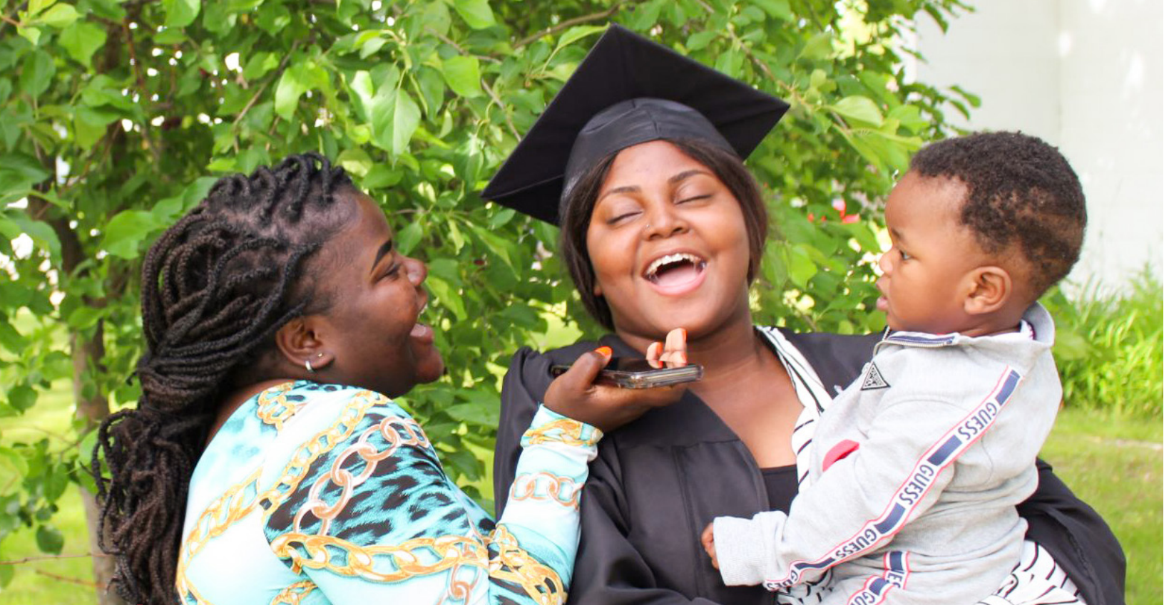
Terra participant sharing her excitement with family