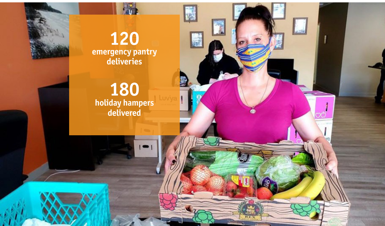
Terra staff supporting C5 Hub deliveries