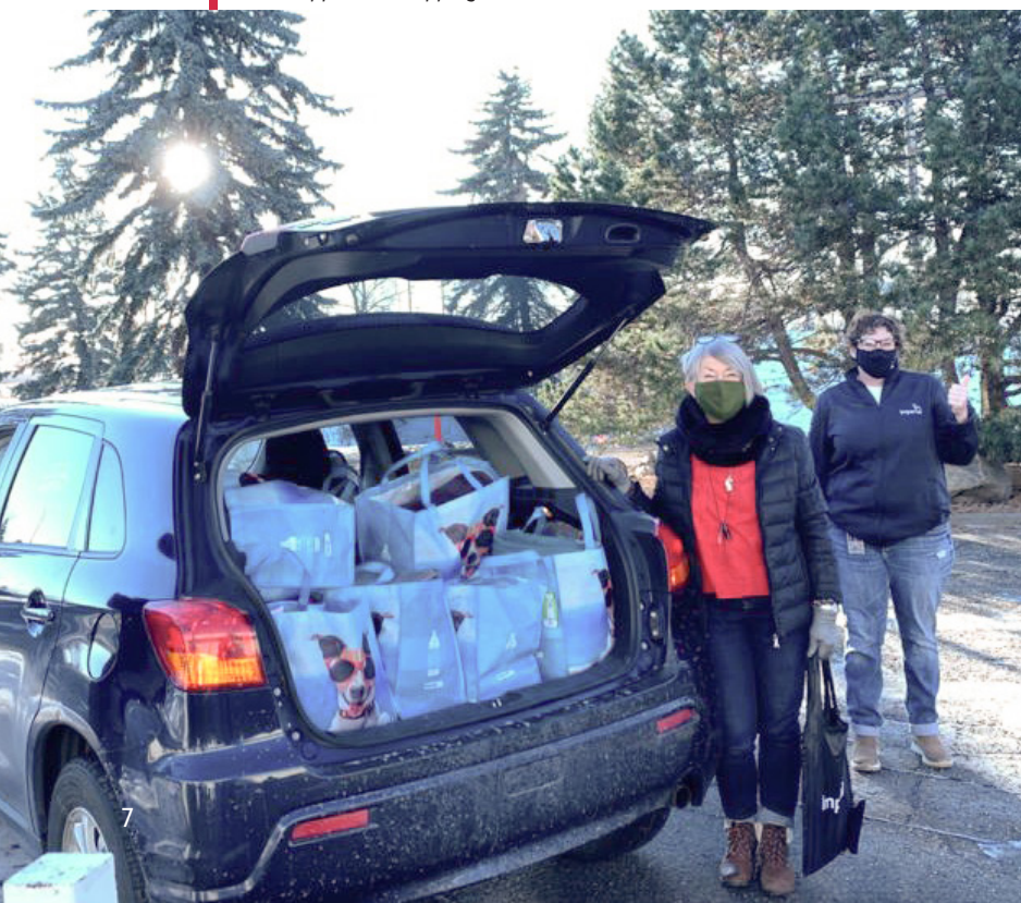
Terra supporters dropping off essential items