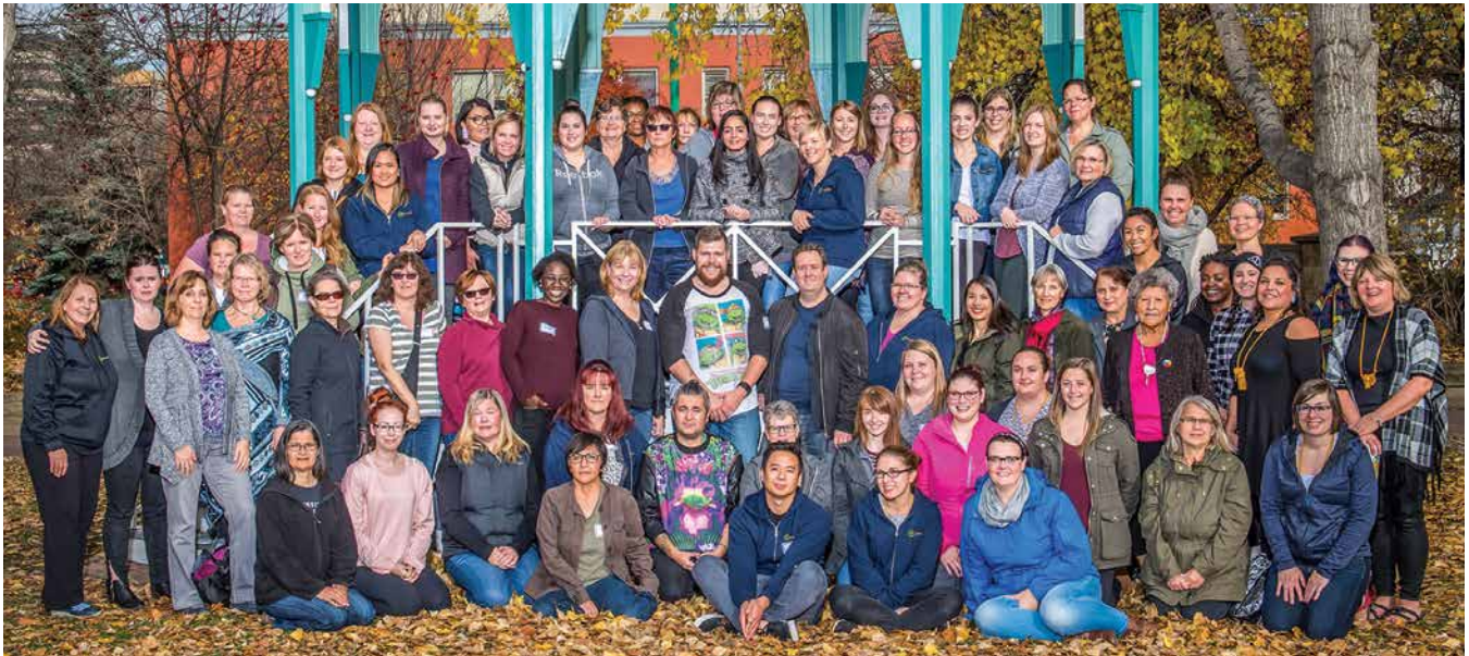
Team Terra, 2017.